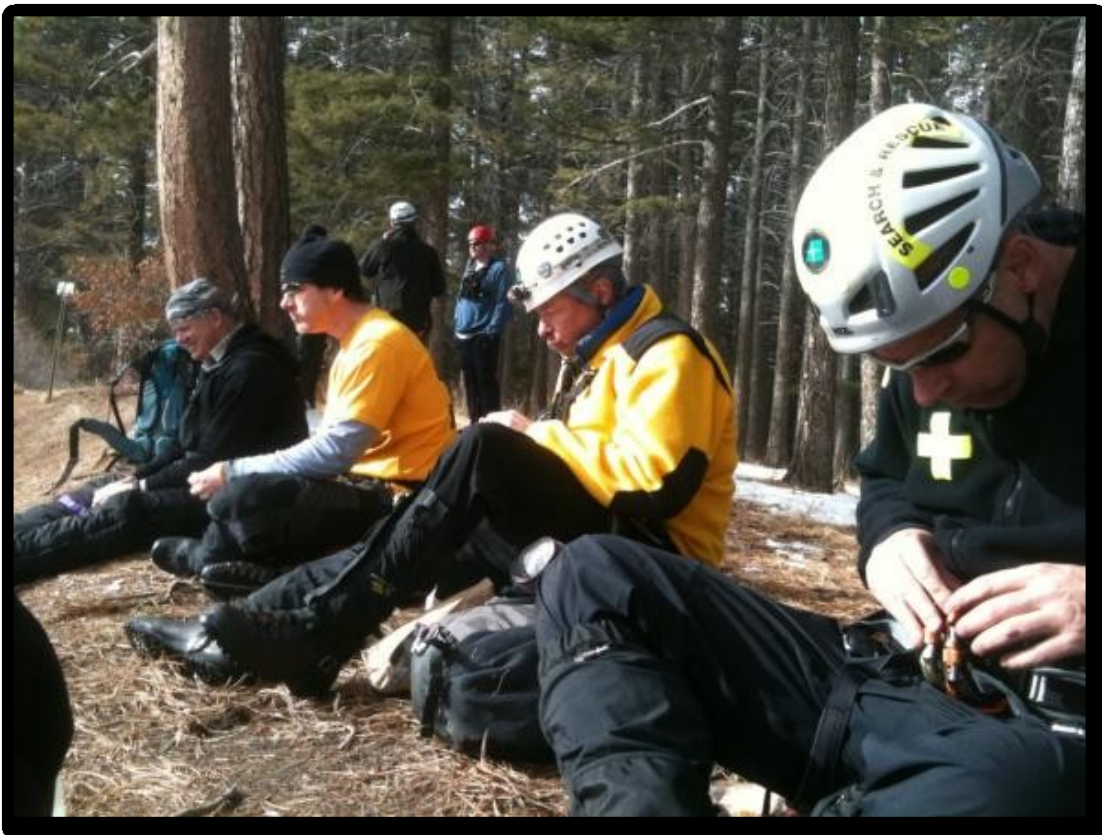
Lunch Break training, Jan 2011