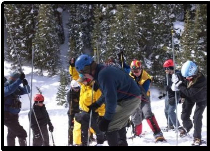
Avalanche Probe Line Training, Feb 2011