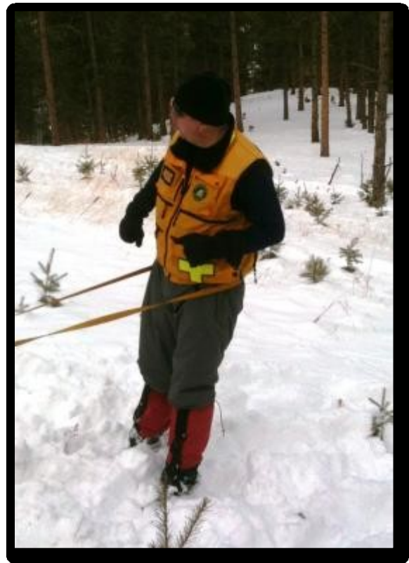
Snow Anchor, Feb 2011